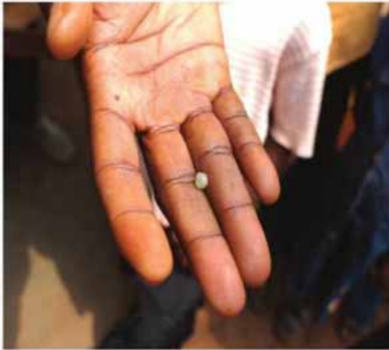
A rough diamond found by an artisanal diamond miner in DRC.