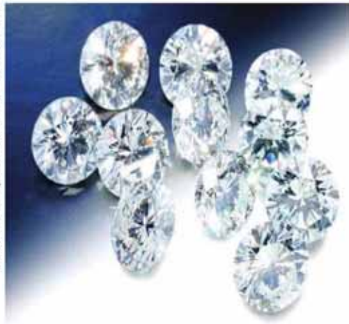
Critics of the Kimberley Process charge conflict diamonds from the Côte d'Ivoire and eastern Democratic Republic of the Congo are still entering the trade.

Q: Can the suspension of corrupt governments from the KP effectively force compliance?