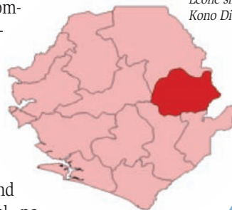
Map of Sierra Leone showing Kono District

This should be of paramount concern for the government and others. Diamond mining areas are difficult places to work, and developmental NGOs – many of whom labour under the mistaken view that diamond areas do not actually need development assistance – are less active there than elsewhere. The recent proliferation of industrial-scale companies, and the work of the United Mineworkers Union (UMU) may, in the long-run, make mining areas more stable and more amenable for aid agencies and NGOs. But in the short run, the government must invest more itself, and should encourage NGOs to move to mining districts like Kono. One way of doing this would be for government to target the district for more of its rebuilding efforts through the National Committee for Social Action (NACSA). It should make this a priority. Kono District has a high concentration of young people, making it a potentially volatile place. Engaging these young people in development-related work and helping with the creation of alternative livelihoods – rather than leaving youth in the usually unrewarding diamond fields – has to become a strategic priority.